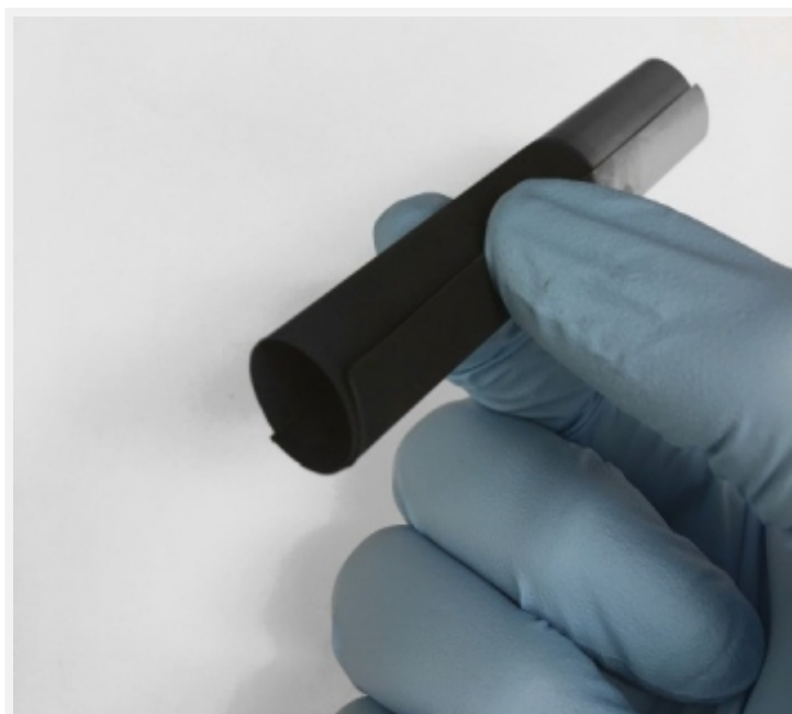
A flexible electroplated lithium cobalt oxide battery electrode can be rolled up.

http://braungroup.beckman.illinois.edu/people/groups/principal-investigator/ , a materials scientist at the University of Illinois, Urbana-Champaign. The process starts by heating lithium and the transition metal of choice, such as cobalt, to 700–1000 °C to form an oxide powder. The high-temperature process ensures the oxide has good crystallinity, which is necessary for high performance. The resulting powder then gets blended with binders and other additives to make an electrode. These additives don't store any energy, and they take up space and add weight, both of which are at a premium in portable electronics.